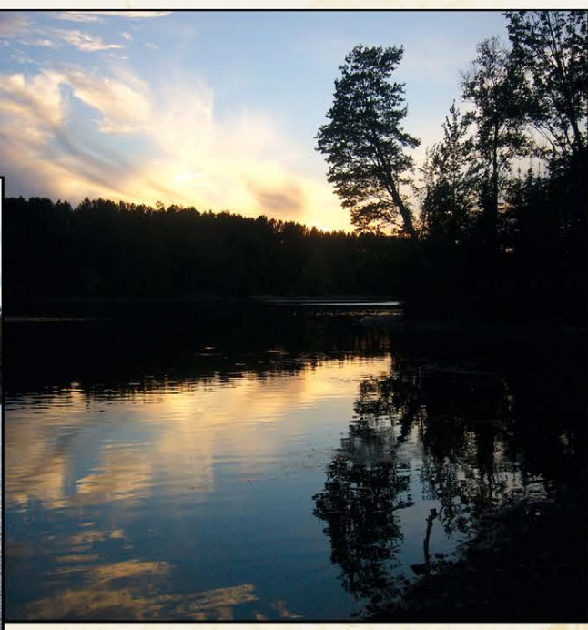
The Turtle-Flambeau Flowage is the largest citizen-owned body of water in the State of Wisconsin.